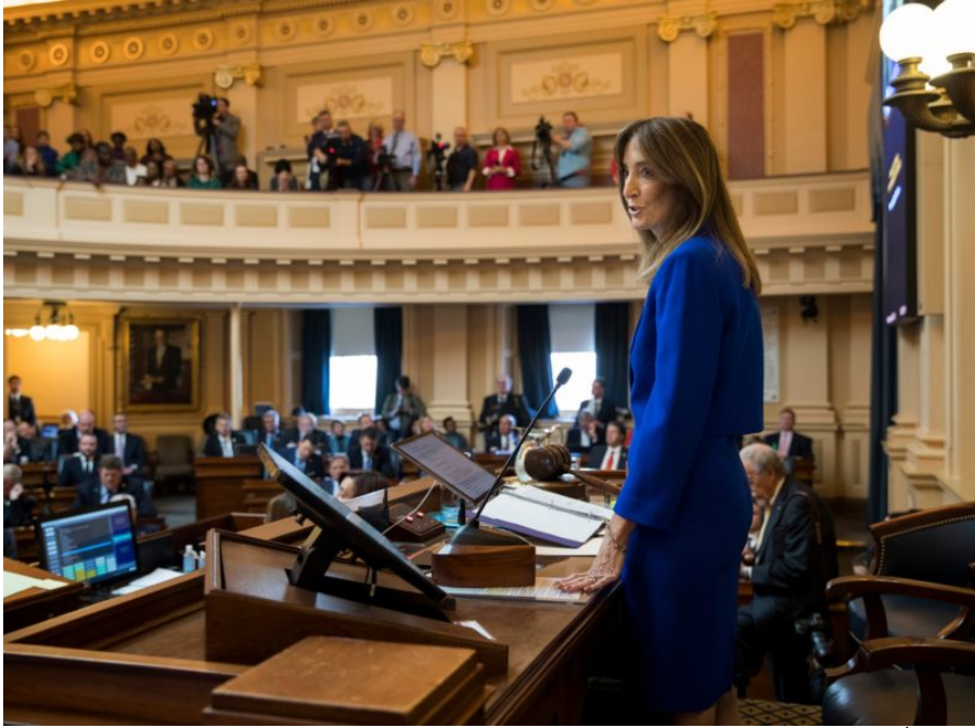
TYRONE TURNER / WAMU